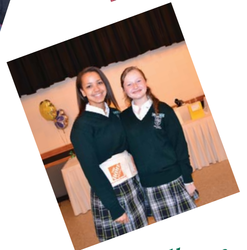
Cub 5K Challenge