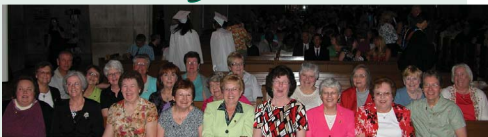
50-year class honored at Commencement.